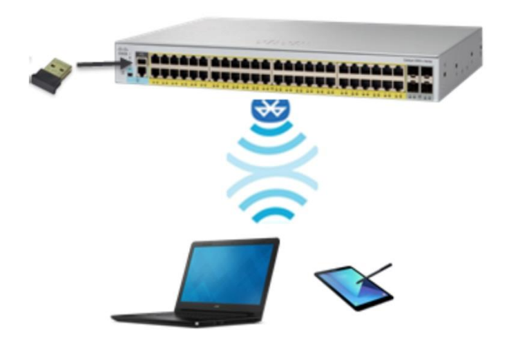
Figure 4. Over-the-air switch access using Bluetooth

• Bluetooth for over-the-air access. The switches support an external Bluetooth dongle that plugs into the USB port on the switch and allows a Bluetooth-based RF connection with an external laptops and tablets (Figure 4). Laptops and tablets can access the switch CLI using a Telnet or Secure Shell (SSH) client over Bluetooth. The GUI can be accessed over Bluetooth with a browser.