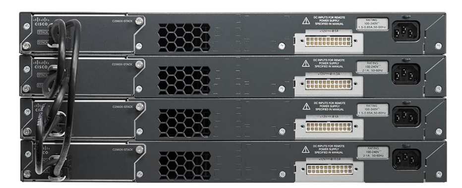
Figure 5. Cisco FlexStack-Plus switch stack

Cisco FlexStack-Extended enables a long-distance out-of-the wiring-closet stack option (floor to floor). It allows back-panel stacking of up to eight Cisco Catalyst 2960-X or 2960-XR Series Switches. FlexStack-Extended can be added to a Cisco Catalyst 2960-X or 2960-XR Series Switch with a back-panel stacking slot. Table 8 lists the switch combinations supported with FlexStack-Extended, and Table 9 lists the scalability and performance with the various software images. FlexStack-Extended is supported in Cisco IOS 15.2(6)E or later and is available in two module configurations: a fiber module and a hybrid module.