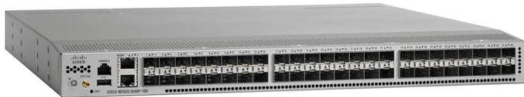
Figure 1. Cisco Nexus 3548 and 3524 Switch

The Cisco Nexus 3548 and 3524 have the following hardware configuration: