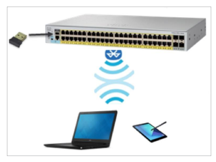
Figure 2. Over-the-air switch access using Bluetooth

• Bluetooth for over-the-air access. The switches support an external Bluetooth dongle that plugs into the USB port on the switch and allows a Bluetooth-based RF connection with external laptops and tablets (Figure 2). Laptops and tablets can access the switch CLI using a Telnet or Secure Shell (SSH) client over Bluetooth. The GUI can be accessed over Bluetooth with a browser.