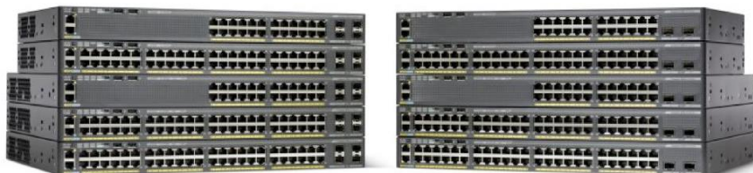
Figure 1. Cisco Catalyst 2960-X Series Switches

Cisco® Catalyst® 2960-X and 2960-XR Series Switches are fixed-configuration, stackable Gigabit Ethernet switches that provide enterprise-class access for campus and branch applications (Figure 1). They operate on Cisco IOS® Software and support simple device management as well as network management. The Cisco Catalyst 2960-X and 2960-XR Series provide easy device onboarding, configuration, monitoring, and troubleshooting. These fully managed switches can provide advanced Layer 2 and Layer 3 features as well as optional Power over Ethernet Plus (PoE+) power. Designed for operational simplicity to lower total cost of ownership, they enable scalable, secure, and energy-efficient business operations with intelligent services. The switches deliver enhanced application visibility, network reliability, and network resiliency.